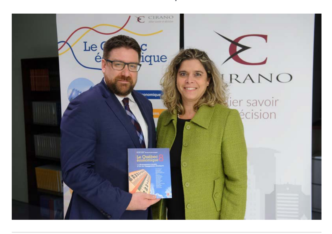
Symposium: Launch of Le Québec économique 8 : Le développement durable à l'ère des changements climatiques